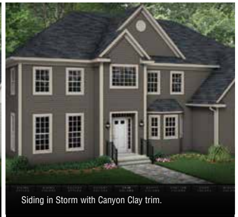
Siding in Storm with Canyon Clay trim.