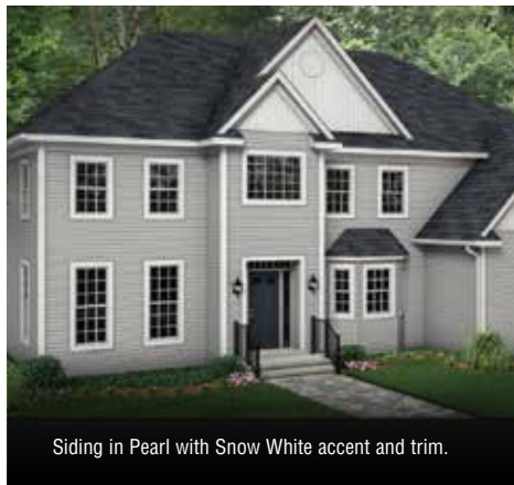
Siding in Pearl with Snow White accent and trim.