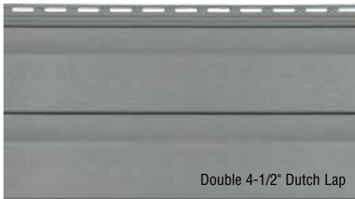
Double 4-1/2" Dutch Lap